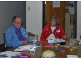
These photos were taken at the December IMPACT meeting in Phoenix.